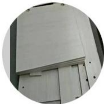
Cutting wood plates